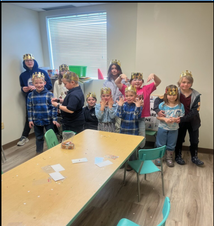
Children enjoying their Sunday school class, each wearing their own crown.